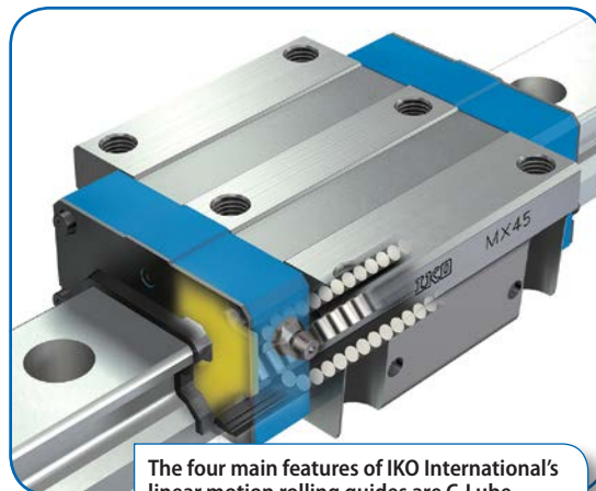
The four main features of IKO International’s linear motion rolling guides are C-Lube technology, interchangeability, multiple slide unit lengths and materials for harsh environments.

The advantages of using linear rolling guides are many,