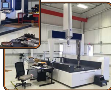
▲ DMG DMC 160 FD duoBlock® 5 axis vertical mill-turn